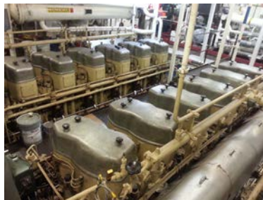
twin MAK 6 cylinder engines