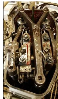
cylinder after 18months

“By installing the Fitch Fuel Catalyst, the residual carbon/soot build-up was eliminated. The boiler operated at maximum efficiency without additional maintenance.”