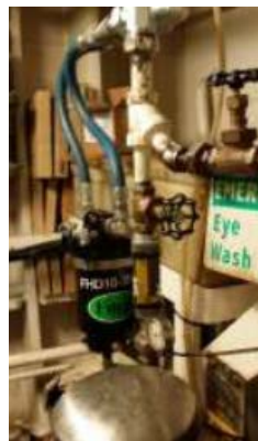
600gph Fitch unit