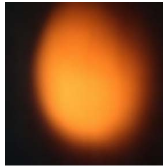
Flame before Fitch