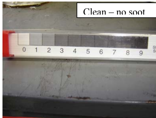
Clean – no soot