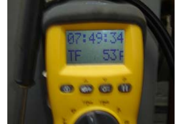
Using UEI Combustion Analyzer – Collect Baseline Data