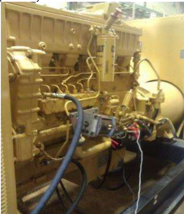
Caterpillar 3406 engine

In addition to the power data provided by a programmable resistive/reactive load bank, exhaust temperature (EGT) and other exhaust data were obtained with the e-Instruments Gas Analyzer used previously.