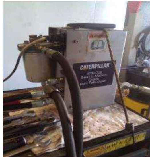
200 gallon day-tank used to supply ULSD#2 for test. Close-up of AIC-6008 fuel flow meter Fuel Measurement Results