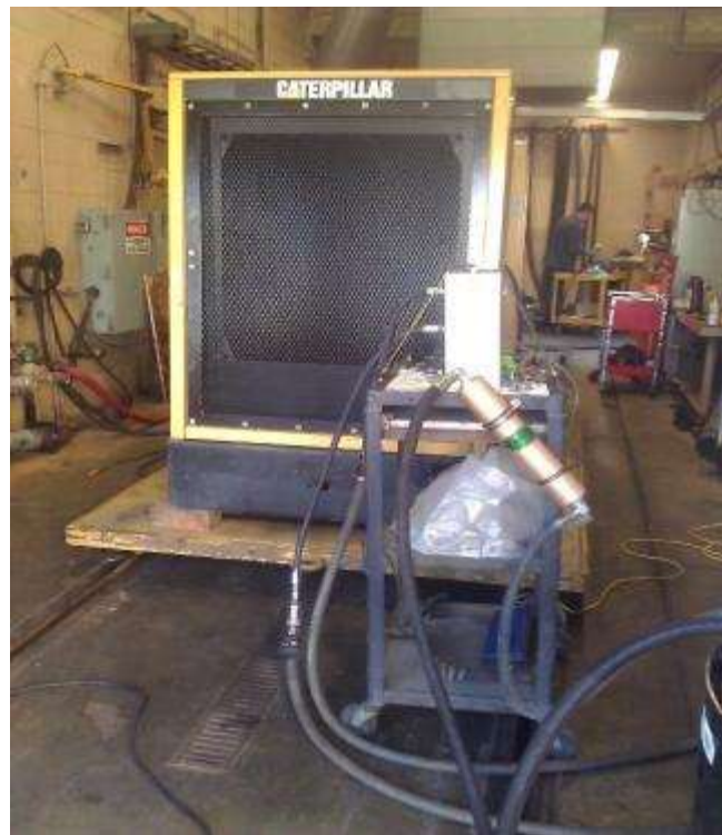
End view of engine with AIC meter and FFC

Some of the key elements of the load bank test are shown on this page. The load bank itself was a permanent unit located on top of the roof of the test bays. The operator pre-programmed the agreed upon test protocol into the computer control module. The test sequence was 20 minutes at each load point (0, 75, 150, 225 and 300 kilowatts) representing 0, 25, 50, 75 and 100 percent of maximum power.